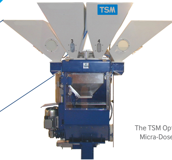
The TSM Opti-Mix™ 600 with Micra-Dose™ Side Feeder